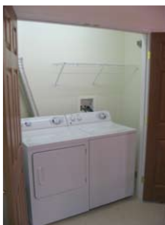
Washers/dryers and walk-in pantries are just off the kitchen.