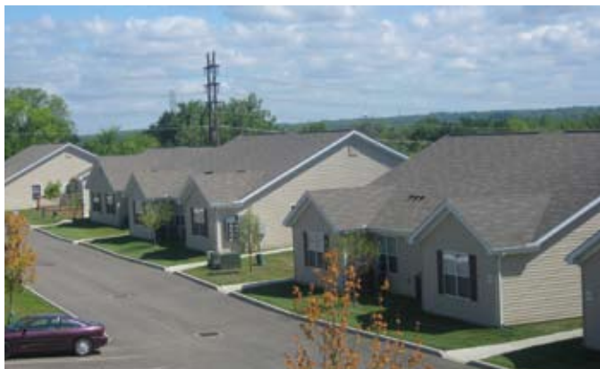
Park right outside your door and enjoy your private patio or deck.