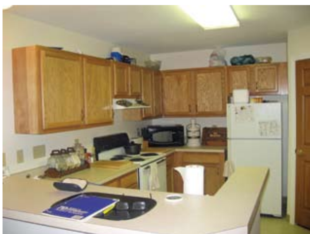
Large kitchen includes new appliances.