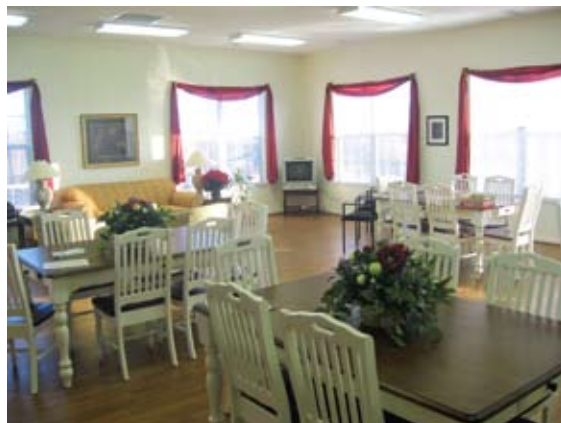
The community room is a wonderful place to meet friends for social events or casual conversation.