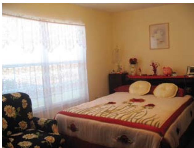
Apartments have large windows and many have views of downtown Dayton in the distance.