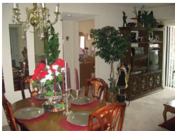
Each apartment has a spacious dining room and living room.