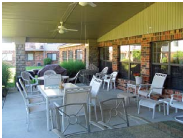
The large courtyard has a shaded sitting area and community garden.