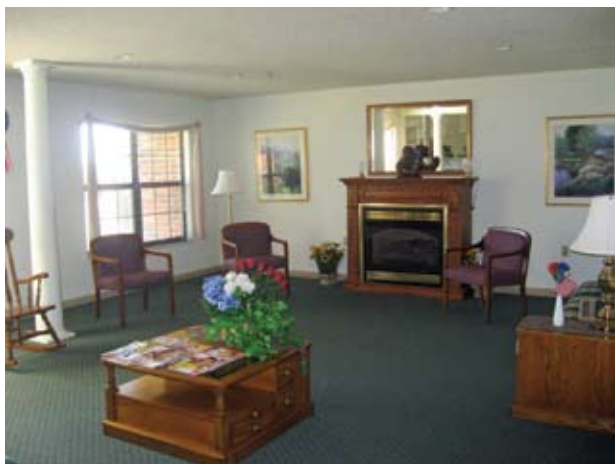
Hoover Place includes many common areas.