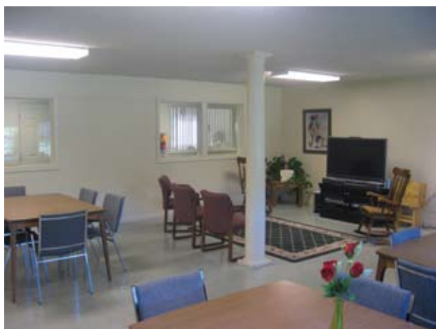
The Wii Videogame bowling league plays in the activity room.