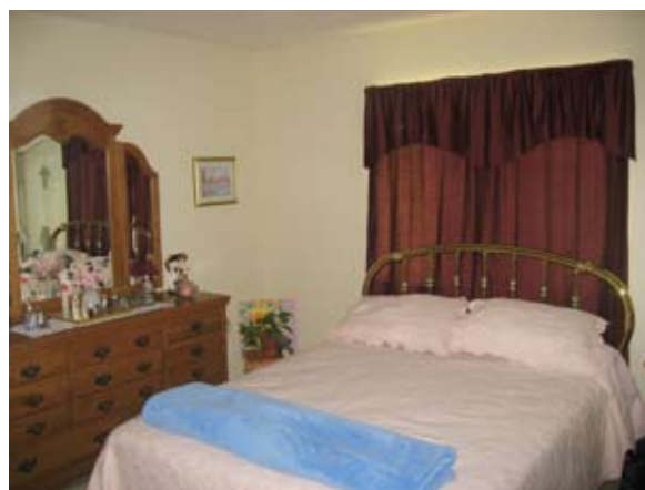
One- and two-bedroom apartments are available.

To arrange a tour, contact us at 937-854-5858 or hoover@smdcd.org .